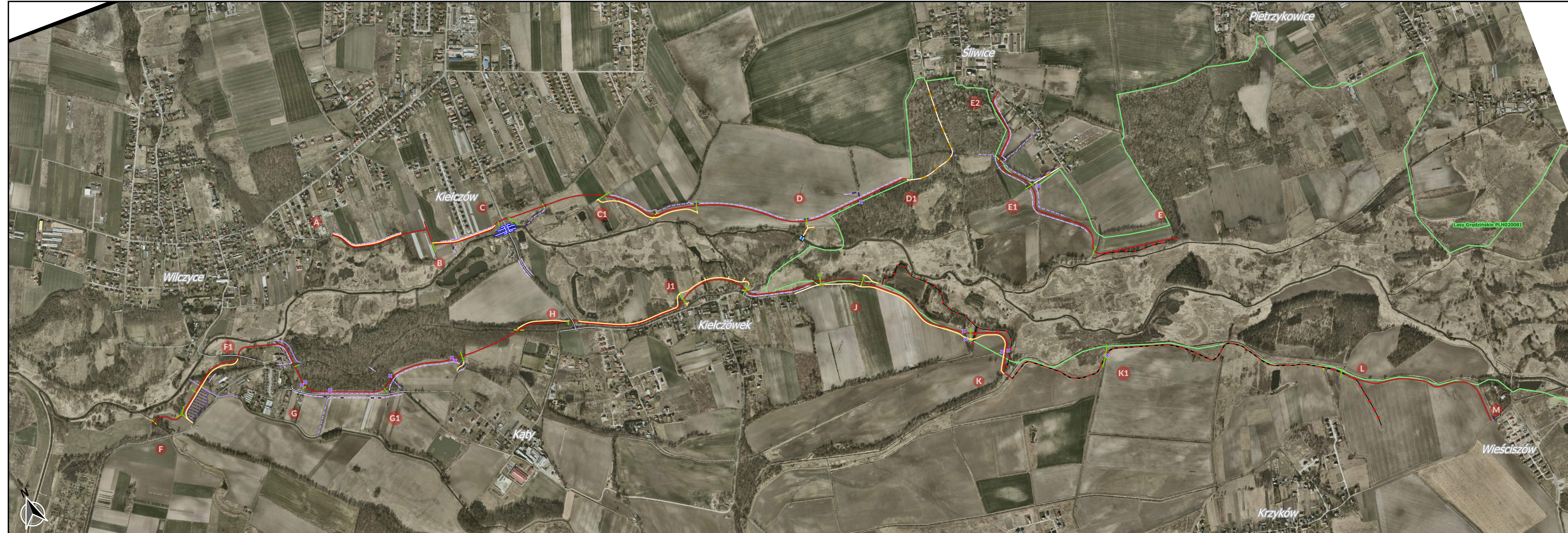
APPENDIX 6b - LOCATION MAP OF THE KEY ELEMENTS OF THE TASK ON THE BACKGROUND OF THE DESIGNATED PROTECTED AREAS Works Contract 1B.7 - WFS Widawa – the rebuilding of the flood management system of the communes and municipalities Czernica, Długoleka, Wisznia Mała and Wrocław